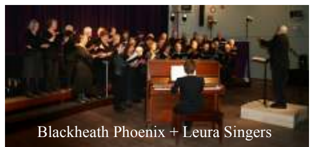
Blackheath Phoenix + Leura Singers