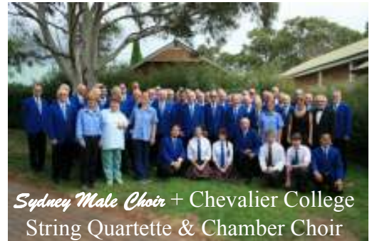
Sydney Male Choir + Chevalier College String Quartette & Chamber Choir

Further information from http://www.challenges.org.au/