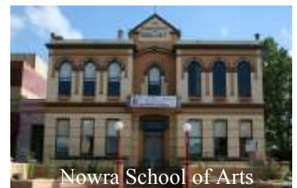
Nowra School of Arts

The lovely 19 th century Nowra School of Arts was the venue for a concert at the invitation of the Shoalhaven Music Club. This was a return visit to the great acoustic and decorative hall where a capacity audience enjoyed